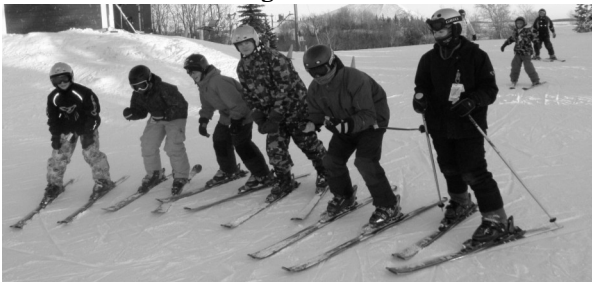
Birtle Collegiate Students enjoy a day at Asessippi Ski Hill. Great Weather...Great Fun...Great Times.