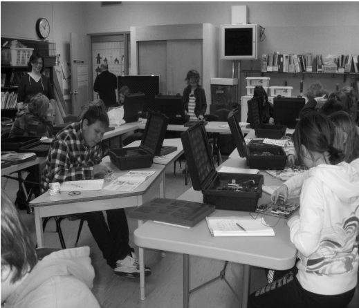
Students work diligently on their projects.