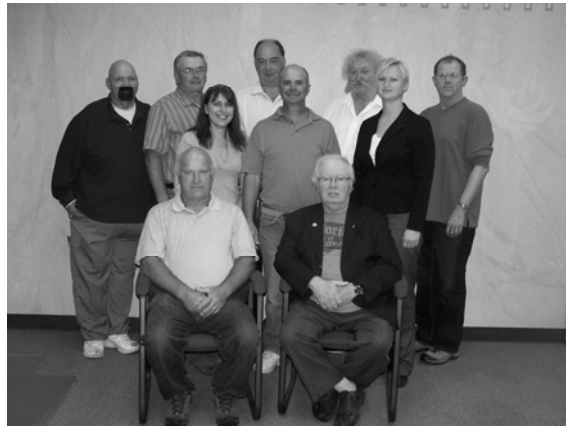
Birtle and District Foundation Board