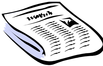
Birtle Outlook hits the press

publishing will come from any local resident around town who wants to contribute. Whether they were at an event, or are hosting an event. If it is worth telling, I would like to include it in the paper. All articles published will be the creations of local residents who have a story to tell.